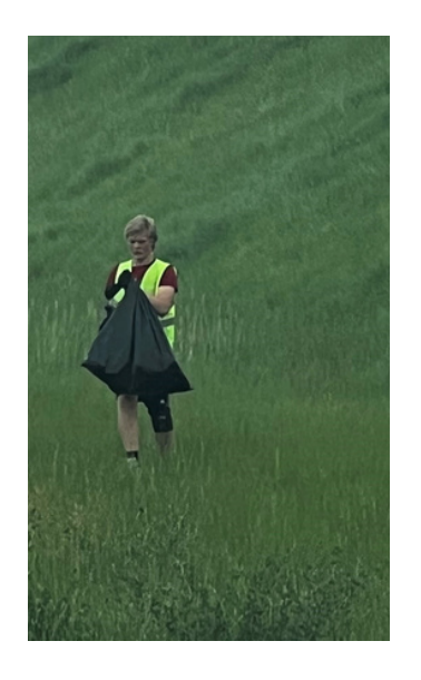
Curry Comb 4-H club teamed up with the Lions Club this summer for their annual highway cleanup. Great job, crew!