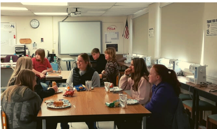
The November Leadership Lunch was attended by four middle school and eight high school 4-H members. Members enjoyed lunch and then learned various icebreakers, games, and ways to divide up members that they can use for club meeting recreation or as a camp counselor. One method for 'find a partner' that they tried was handing out cards with various animals on them and making the animal noise to find your partner.