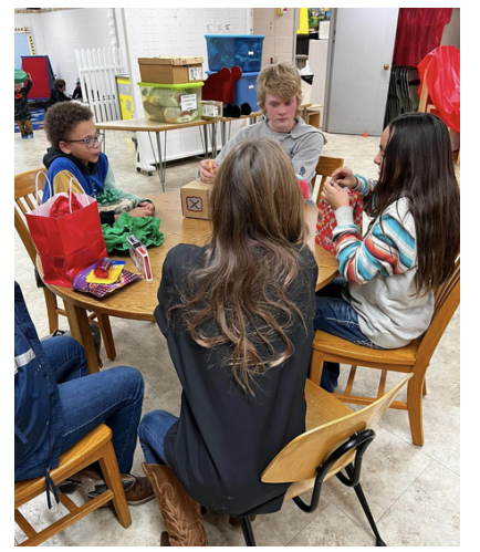
Christmas Party fun for Clever Clovers, Longview, & Curry Comb clubs