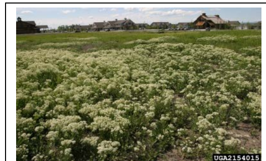
Whitetop can quickly fill in abandoned lots forming near monocultures.

http://msuextension.org/publications/AgandNaturalResources/EB0138.pdf