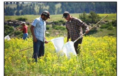
Figure 3. Sweep nets can be used to assess insect populations.