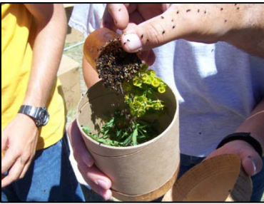
Figure 2. A cardboard container is ideal for storing insects.

Obtaining insects: Biocontrol insects can be purchased through private businesses, and sometimes acquired through your county weed district. Many areas have local insect collection events; ask your weed coordinator if there are any planned in your county or nearby counties. If you do have access to a good population of biocontrol insects you can collect them yourself using a sweep net or aspirator, or even by hand-picking. If you collect your own, make sure to place them in a well-ventilated container (Fig. 2), and to chill them immediately using a refrigerator or cooler. Release insects as soon as possible following collection or purchase.