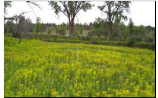
Figure 1. This patch of leafy spurge is a candidate for biocontrol because of its size and density.

Long term management: Avoid excessive disturbance of release sites, such as heavy grazing or tillage, for five to ten years to allow insects to establish. Herbicides can be integrated into management of biocontrol sites by spraying the perimeter of large weed patches and any satellite patches that occur. If monitoring reveals that insect populations are thriving, collection and redistribution of insects to a new area is a great idea.