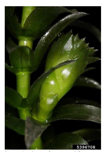
Figure 2. Linear leaves with serrated edges.