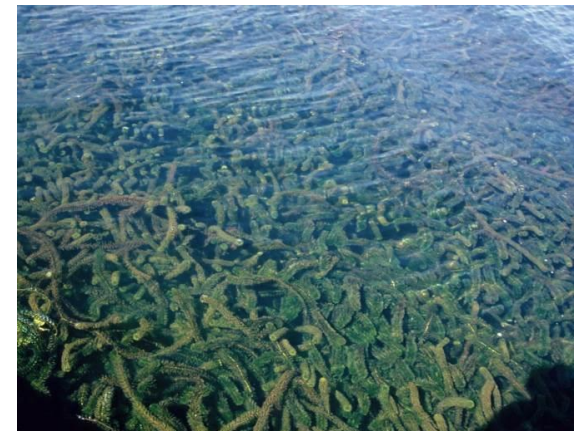
Figure 3. Brazilian waterweed forming a dense mat.