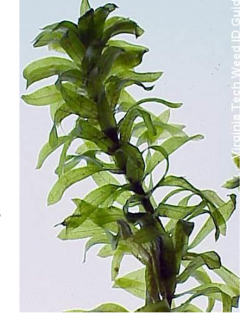
Figure 1. Plant with dense whorls of bright green leaves.

nearby states like Idaho, Washington, and Oregon. It is unknown whether it would be able to establish in the relatively cold climate of Montana; freezing is reportedly lethal. Since aquatic plants can be very difficult to eradicate or control, prevention followed by early detection and rapid response is critical for management in Montana. Control of established plants is possible with herbicides such as diquat, fluridone, and penoxsulam. Mechanical removal as the only control measure of well-established populations is believed to be ineffective. However, control of small populations by mechanical means may be effective if fragments and roots are completely removed.