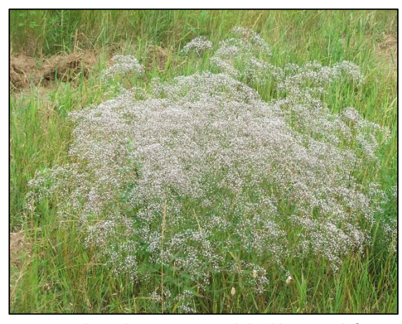
Figure 1. Plant, demonstrating globe-like growth form.

Identification: A member of the Pink (Caryophyllaceae) family, baby's breath is a multi-branched, perennial forb that can grow up to 3' tall; often the plant appears globe-like in shape due to it branching nature (Fig. 1). Leaves are opposite, lance-shaped and arise at swollen nodes (a characteristic of the Pink family) (Fig. 2). The number of leaves decreases with increasing plant height and during flowering. Sweetly-scented flowers are small and white with 5 sepals and 5 petals (Fig. 3). Fruits occur as small capsules that contain 2 to 5 black, kidney-shaped seeds. It has a taproot.