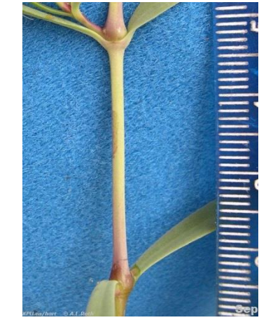
Figure 2. Leaves arising from swollen nodes.

<u>Habitat</u>: Although it can persist in many types of habitats, large populations most often occur in coarse-textured soils in pastures and hayfields, lightly to heavily grazed rangelands, roadsides, and other disturbed habitats. It is often found in high densities along fence lines or in ravines due to its tumbling habit.