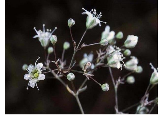
Figure 3. Small white flowers.

<u>Management</u>: In Montana baby's breath is not on the state noxious weed list but is listed as a county noxious weed in the following counties: Blaine, Broadwater, Chouteau, Daniels, Deer Lodge, Flathead, Jefferson, Richland, Sheridan, Silver Bow, and Valley. Since 1934 it has been reported in 22 counties in Montana. Because it is not widely distributed across