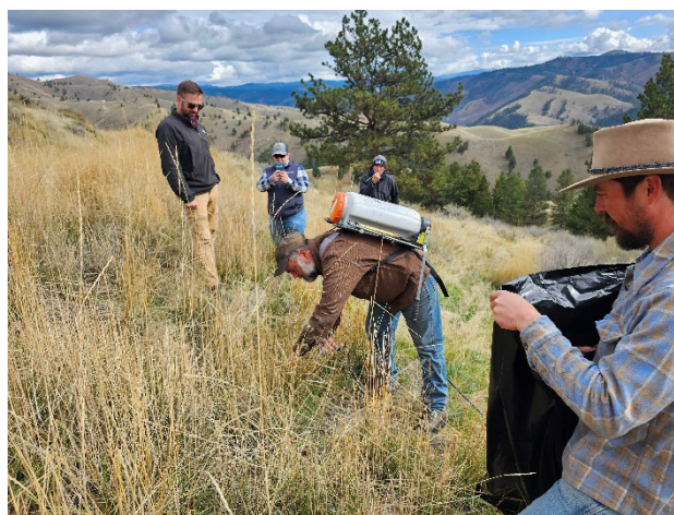
Treating rush skeletonweed in Ravalli County, fall 2023.

Recent Activities Some of the EDRR Program's recent activities have included helping to coordinate an annual gathering of stakeholders to treat tansy ragwort at a satellite population in Lewis & Clark County (within Montana, tansy ragwort has been primarily and historically contained to Lincoln County); quickly assembling a team to smite a surprise patch of invasive phragmites west of Bozeman in Gallatin County; and presenting on Palmer amaranth and waterhemp at the Montana Weed Control Association Spring Coordinator Training in Miles City. If an action is needed to help keep high priority invasive plants out of Montana, the EDRR Program is willing to do it.