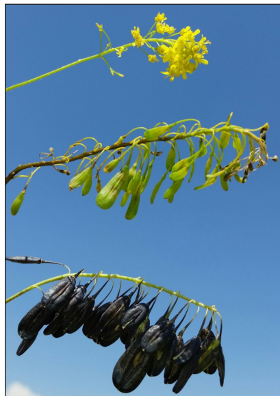
FIGURE 4. Dyer's woad has yellow flowers with four petals and pendulum-like, teardrop-shaped seed pods that turn black at maturity.

Management: Dyer's woad management in Montana is currently coordinated by the Montana Dyer's Woad Cooperative Project, and management priorities are education, prevention, and eradication. Known populations of the plant are monitored by cooperators and detector dogs, and each year plants are hand-pulled or treated with herbicides. Preventing seed production is critical for eradication efforts as dyer's woad only reproduces by seed. To prevent new infestations, make sure vehicles, equipment, and outdoor gear are clean, and use weed seed-free forage for livestock. Learn to identify this