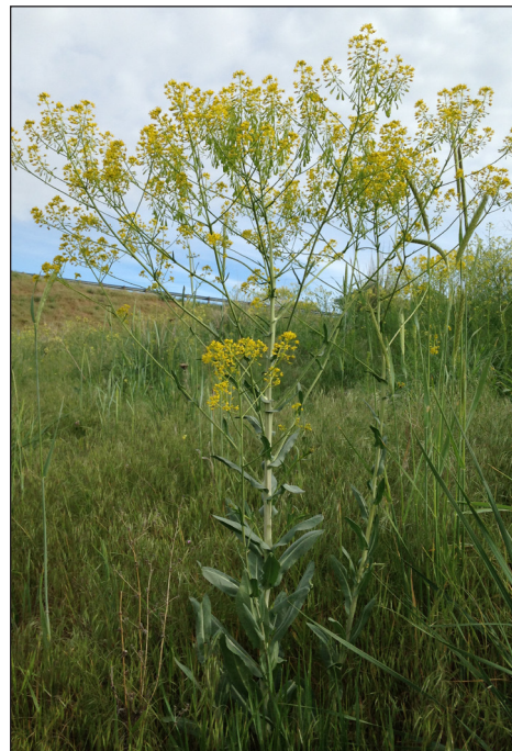
FIGURE 2. Dyer's woad is from one to four feet tall with small yellow flowers in a flat-topped arrangement.

Biology, Spread and Impacts: Dyer's woad usually grows as a biennial, meaning it forms a rosette in the first year and flowers, sets seed, and dies the second year. However, it sometimes displays an annual or perennial life history. This species reproduces only by seeds which are produced from early summer through fall. Each dyer's woad plant