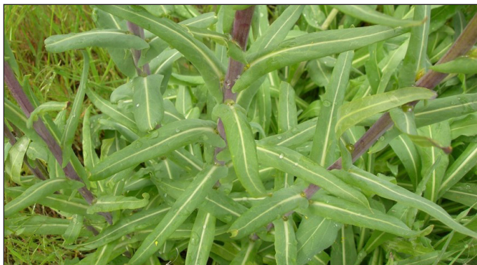
FIGURE 3. Dyer's woad leaves have a distinctive cream-colored midvein. Stem leaves are hairless and rubbery with clasping bases.

may produce between 350 and 500 seeds. Most seeds fall close to the parent plant, but they can travel longer distances when moved by humans, water, or wildlife. For example, in Montana there is an association between dyer's woad populations and roads, railroads, and other human travel corridors. Dyer's woad can be problematic in rangeland, pastures, and cropland, where it reduces the productivity of these systems. This species decreases grazing capacity of rangelands and wildlands for both livestock and wildlife.