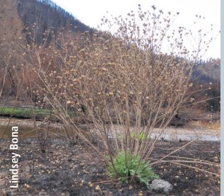
Spotted knapweed is a common noxious weed in Montana and is shown here, re-sprouting after wildfire.

A study in Montana looked at herbicide and revegetation treatments with the goal of restoring spotted knapweed-infested areas to desired plant communities after a wildfire (Pokorny et al. 2010). Broadcast or spotspraying picloram both decreased spotted knapweed, but spot-spraying had less of a negative effect on native plants. Seeding desired species had no effect on spotted knapweed in the short-term. Researchers suggested continued management of spotted knapweed using spot applications of herbicide while desired species continue to establish.