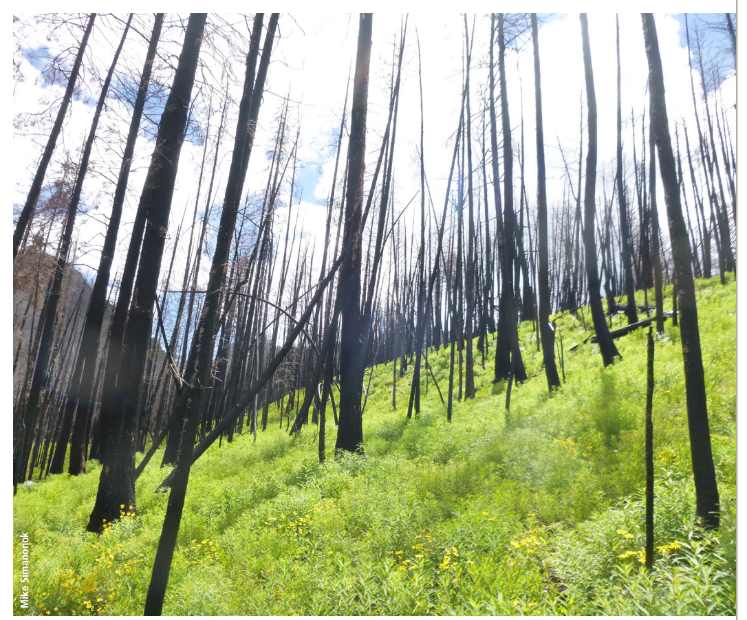
Many areas naturally recover from wildfire. Seeing a flush of green growth can be common after wildfire.

your property because of patchiness in burn severity, weed cover and vegetation type. Consider focusing revegetation efforts on highly disturbed patches (i.e., severe burn and high weed cover) that may coincide with areas disturbed by fire suppression activities, for example fuel breaks, fire lines, and equipment staging areas. Research in Montana has shown that fuel breaks and fire lines are particularly susceptible to invasion by cheatgrass.