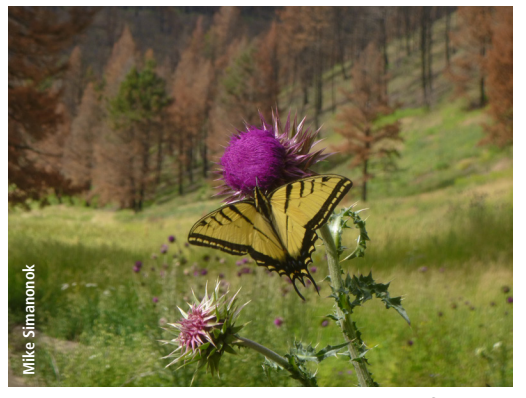
Musk thistle, above, is a common species found growing after wildfire.

Perennial broadleaf forbs are common post-wildfire, especially those with deep root systems. Because even the most severe fires typically damage roots only down to four inches below the soil surface, weeds with root systems below that depth often endure and prosper post-burn. Rhizomatous weeds have extensive root systems that can