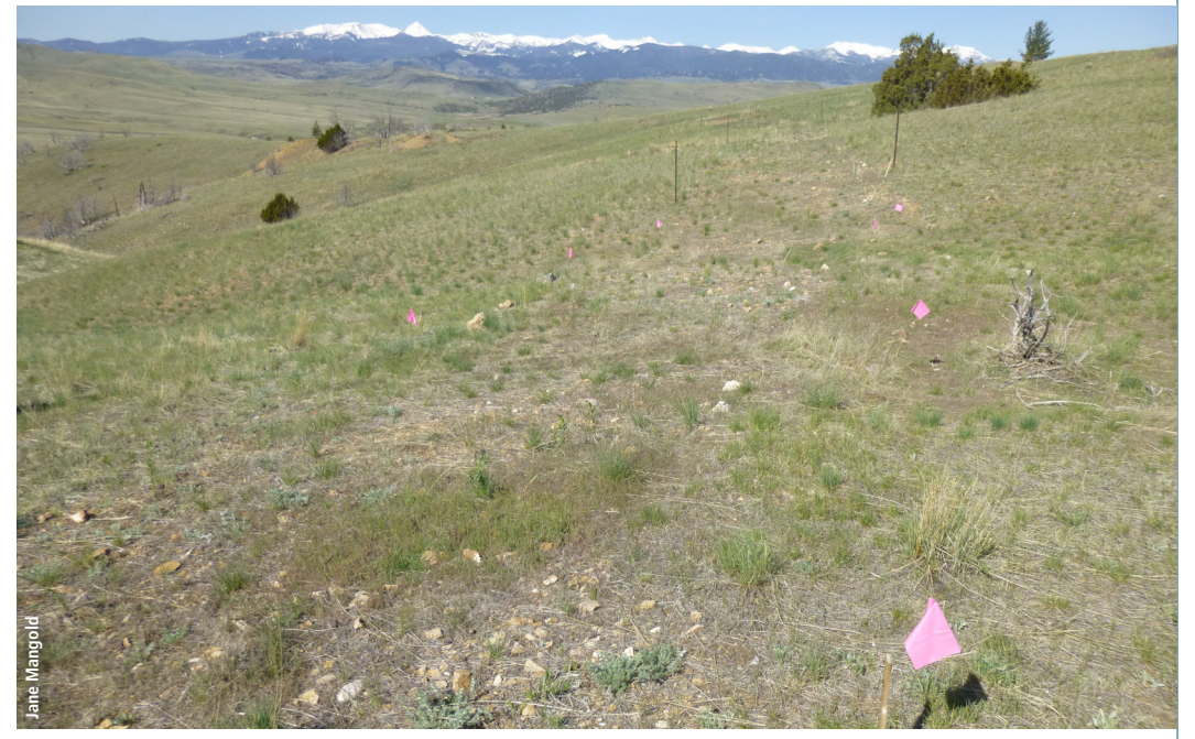
Key areas to monitor early and often are disturbed areas such as roads, trails, and fire breaks, shown here marked with posts and pin flags.

It is easier and less costly to control small infestations compared to large-scale, established infestations. Eradication is most effective on newly established weed populations where individual weeds can be removed and steadily replaced with desired