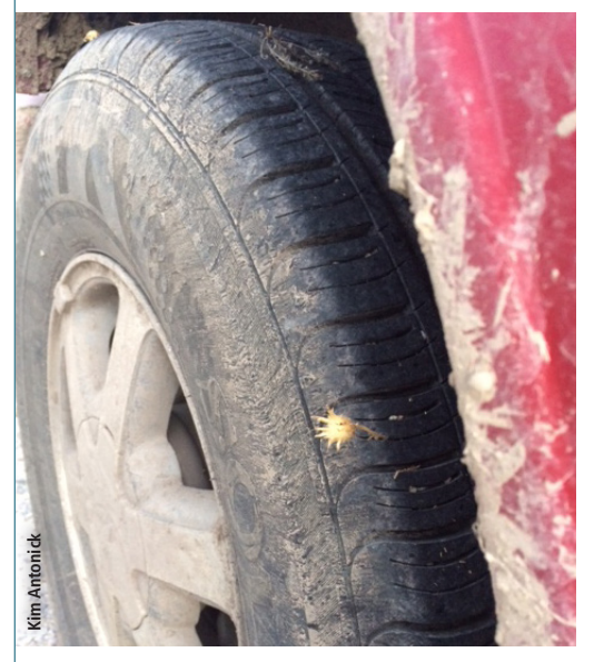
One way to limit weed seed dispersal is to clean the undercarriage and tires of vehicles before entering a burned area. Shown here is a spotted knapweed flower head stuck in tire tread.

Preventing or greatly limiting seed dispersal is an important part of minimizing the introduction or spread of weeds after wildfire. If you imported hay as supplemental feed for livestock after a wildfire, ideally it was certified noxious weed seed-free, but even so it could contain undesired weeds that are not labelled as noxious. Feed hay to your livestock in a restricted area and closely