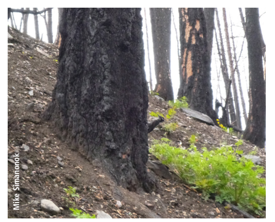
One characteristic used to help determine burn severity is the level of charring on trees and stumps.

After considering what weeds and desired plants were present before the wildfire and are likely to be present afterwards, the next step is to estimate the burn severity on your property; this should be done within one month of the burn (assuming it is safe—standing dead trees can be a hazard). This information, paired with your estimate of weed cover, will help determine if revegetation is recommended or if habitat can recover without intervention.