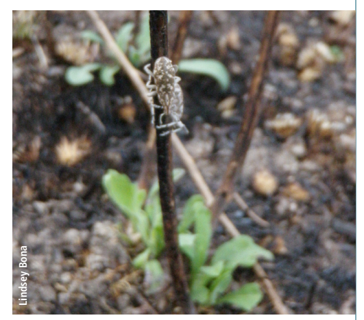
How wildfire affects previously established biocontrol agents depends on a variety of factors, such as the size and timing of the wildfire.

Classic biological control (biocontrol) involves the use of a living organism (e.g., plant-feeding insects, mites, or pathogens) to reduce a noxious weed population. Noxious weeds in Montana are not native to North America and usually do not have natural enemies here, which can be one reason why weeds grow so well. These natural enemies, referred to as "biocontrol agents," go through a rigorous testing process before being released in the United States. The goal in using biocontrol agents is to reduce the density and health of the target weed; biocontrol does not typically eradicate a noxious weed. If you are interested in using biocontrol agents on your property, consider the size of the weed infestation. Management by biocontrol agents is most effective on large-scale weed infestations (at least 5-10 acres) and is not recommended for small infestations or newly invading weeds that can be eradicated with management tools.