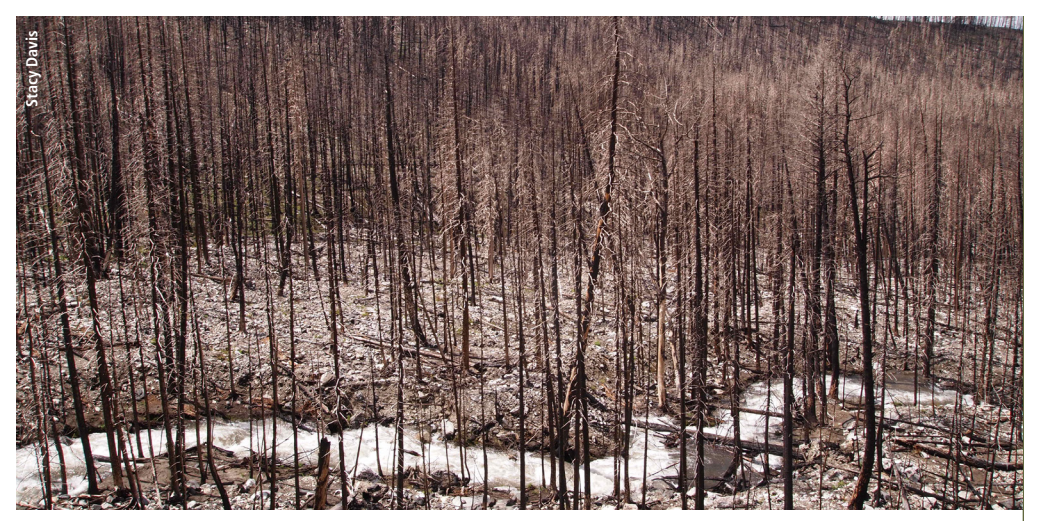
High severity fires have uniformly gray or white ash and shrub stumps, and small fuels are entirely consumed.

Things to look for to determine burn severity include the color of soil, amount of remaining duff and debris, color of ash, level of charring on shrub stumps and small fuels, as well as the presence of hydrophobicity (Table 1, below). Hydrophobicity occurs when the soil