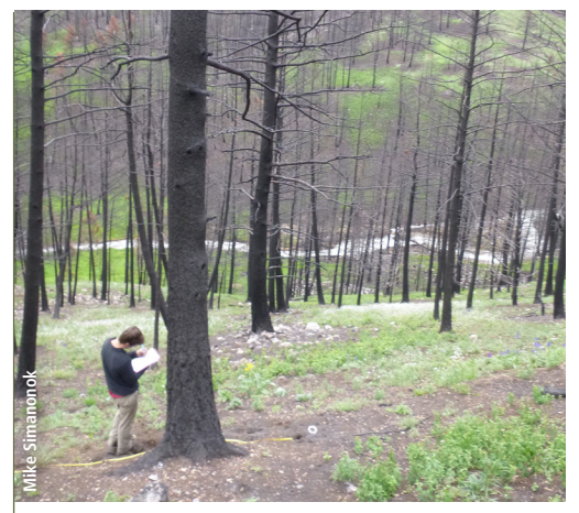
Monitoring is an important step in weed management after wildfire.

If there are areas immediately adjacent to the burned area with moderate weed cover, it is possible that the burned area had a similar degree of cover by the same weeds. Depending upon the severity of the burn and weed characteristics, you can expect some degree of weed survival in the burned areas. Remember that it may take weeks to months for vegetation to start growing again, so exercise patience when monitoring for weeds and desired plants.