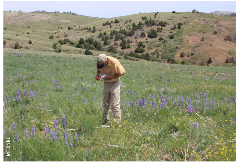
Monitoring after weed management is important to assess what worked and what didn't. Monitoring options include photo-points or transects.