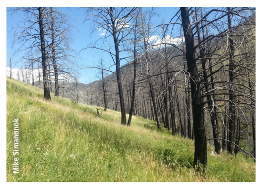
Grasses are often seeded on hillsides susceptible to soil erosion after a wildfire.

Revegetation typically involves seeding grasses and sometimes forbs. Grasses are seeded because they can establish quickly, provide erosion control, and take up space that might otherwise be used by invading weeds. Historically, non-native grasses were seeded soon after the burn with the main goal of establishing vegetation on a hillside to help prevent soil loss/erosion. However, this practice is not always recommended because non-native grasses may hinder natural recovery of a site. Research and practice have shown that if non-native grasses are sown, you can expect them to persist, which may or may not be desirable depending on land use goals. Seeding native grasses is now more commonly recommended. Species should be