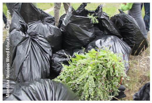
Be sure to bag weeds in garbage bags after hand-pulling to reduce the spread of seeds.

Mowing is an important management strategy, but it is important to limit