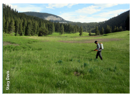
Chemical control is the use of herbicides to reduce vigor of plants.