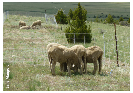
Targeted grazing can be used to address specific problem areas such as fire breaks.

If you are moving livestock from a weedy area, it is a good idea to dry-lot the livestock for a minimum of three days before moving