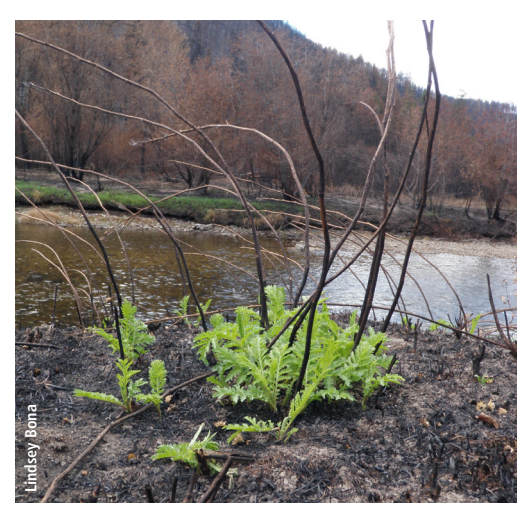
The most effective time to apply systemic herbicides is when the target weed is actively growing. This could be in the fall, after wildfire, when the base of the weed starts to regrow.

bud growth stages) or in the fall when the base of the weed starts to regrow. Seedlings of winter annual grasses like cheatgrass, Japanese brome, and ventenata (Ventenata dubia) emerge in the fall. Because most wildfires occur in late summer, fall may be an ideal time to spray weeds. Weeds will likely be the first plants to start growing after fire and may be easy to locate and treat with an herbicide. This is especially true for winter annual grasses like cheatgrass, Japanese brome, and ventenata.