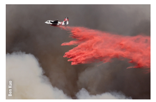
Fire retardant, often aerially applied to wildfire, can act as a fertilizer on the ground.

Activities associated with fighting wildfire can also affect plant communities. Fuel breaks and fire lines disturb the ground and remove existing vegetation, thus creating bare ground. One study in Montana followed the response of vegetation in a fire break; cheatgrass (Bromus tectorum), which was already present in the area at low densities, increased greatly in the fire break and did not decline over time, whereas cheatgrass increased initially in the adjacent burned area but then returned to pre-fire levels after the first year (Seipel et al. 2018). Fire retardant, which has high levels of ammonium and phosphorous, can act as a fertilizer. Although retardant typically covers small areas on the landscape, it can cause localized shifts in plant competition and influence which species dominate. One study from Montana showed that cheatgrass, which was again already present in the area, increased in abundance when fire retardant led to a pulse in high resource availability (Besaw et al. 2011).