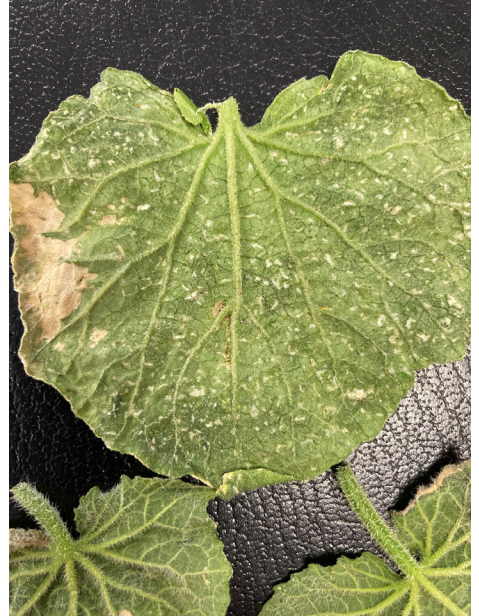
Thrips damage on the underside of a cucumber leaf.

Disclaimer: These recommendations are provided only as a guide. It is always the pesticide applicator's responsibility, by law, to read and follow all current label directions for the specific pesticide being used. If any information in these recommendations disagrees with the label, the recommendation must be disregarded. No endorsement is intended for products mentioned. The authors and Montana State University assume no liability resulting from the use of these recommendations. The Montana State University Extension Service is an ADA/EO/AA/Veteran's Preference Employer and Provider of Educational Outreach.