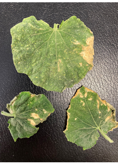
Thrips damage on the upper surface of a cucumber leaf.