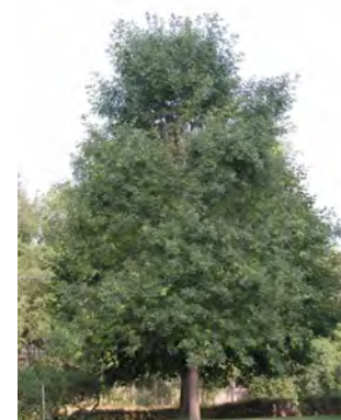
Green ash 2

Ash are the most commonly planted trees in many Montana communities east of the Continental Divide. Ash species represent more than 40% of all publicly-owned trees in 20 Montana communities. The pest is also easily transported through infested firewood. Emerald ash borer can also naturally spread by flying approximately 2 to 12 miles per year. Ash trees that are killed by EAB become particularly brittle and liable to breakage, which then threatens property and public safety.