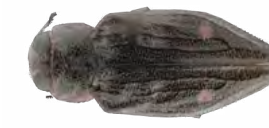
Chrysobothris sexsignata 19