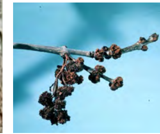
Ash flower gall mite 16