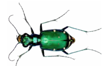
Cicindela decemnotata 21