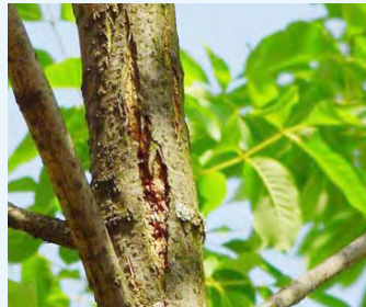
Bark splitting from EAB infestation 25