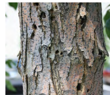
Damage from lilac/ash borer 14

Ash trees in Montana are commonly stressed by various pests and conditions including lilac/ash borer, western ash bark beetle, cankers/disease, drought, frost, herbicides, and mechanical damage. Homeowners can usually rule out these common issues prior to submitting samples.