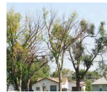
Dieback of ash trees (environmental) 11