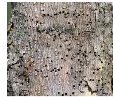
Damage from Western ash bark beetle 15