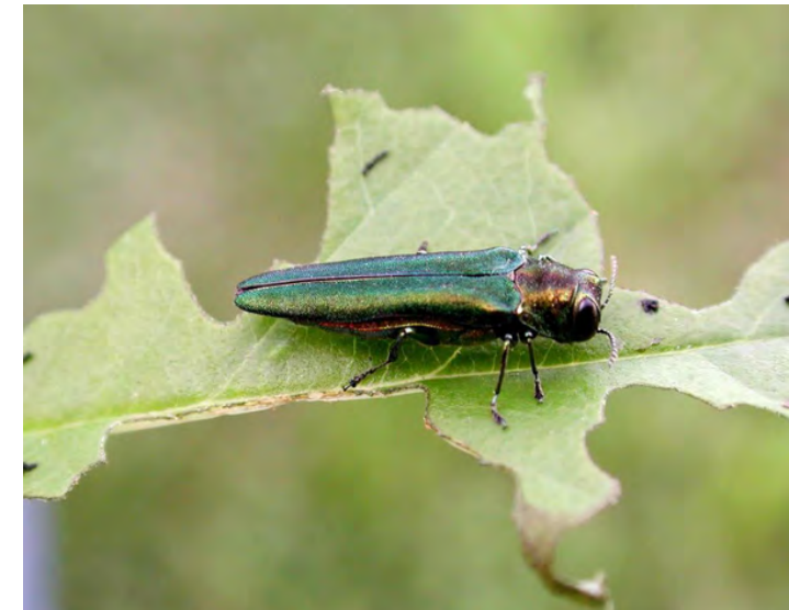
Emerald ash borer, Agrilus planipennis 1

The emerald ash borer (EAB) is a destructive wood-boring insect that has killed millions of ash trees in North America. It was first discovered in Detroit, Michigan in 2002, and it likely came from wood packaging material imported from Asia. It has become widely established in 35 states and five Canadian provinces. As of March 2020, it has not been detected in Montana. Unfortunately, it is easily transported on firewood so Montana is always just one visitor's mistake away from EAB establishing here. This fact sheet provides information on the EAB biology and damage symptoms, what you can do right now, management recommendations if the EAB is found in Montana, other ash pests or non-EAB ash issues, and EAB look-alike insects in Montana.