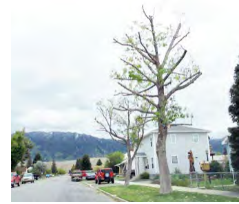
Topped ash trees 10