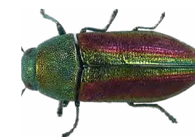
Chrysophana placida 20