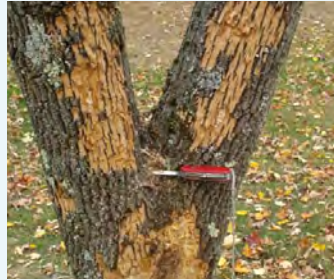
Damage from woodpeckers feeding on EAB larvae 22