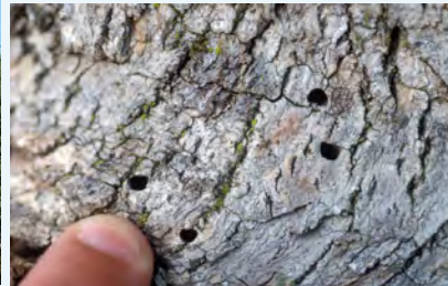
D-shaped exit holes in trunk 24