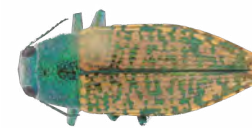
Buprestis confluenta 18