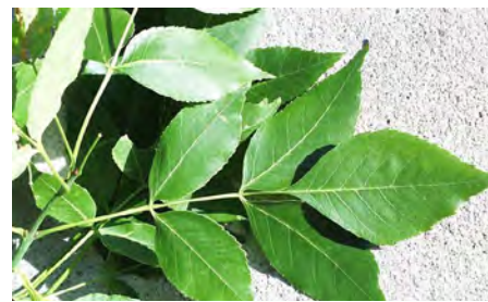
Green ash leaves. 3

Emerald ash borer attacks all true ash species ( Fraxinus sp. ) and the white fringetree, Chionanthus virginicus . Mountain-ash trees are not true ash trees and they cannot become infested with EAB. Proper identification of true ash trees is critical. Ash trees have opposite, compound leaves with short-stalked leaflets. Leaflet margins may be smooth or toothed.