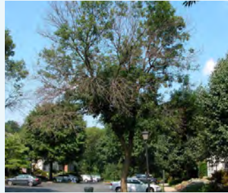
Thinning in upper canopy 23