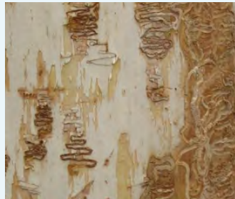
Serpentine galleries under the bark 26