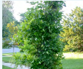
Epicormic branches and shoots at base of tree 27