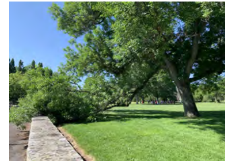
Sudden branch drop 13