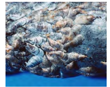
Oystershell scale 17