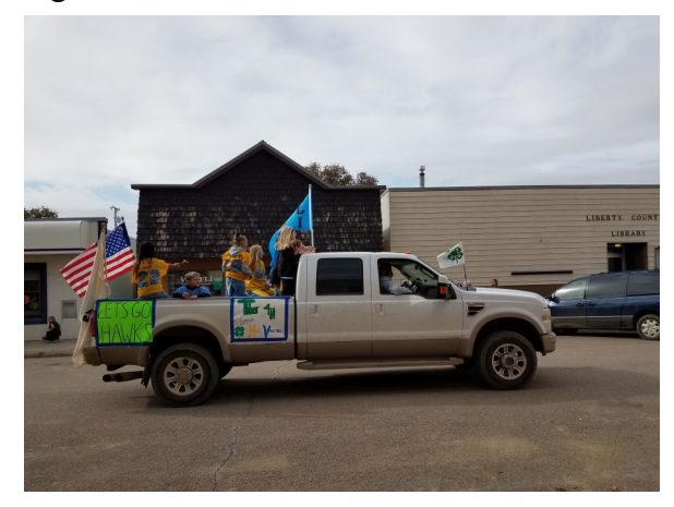
Montana 4-H—The youth development program of Montana State University