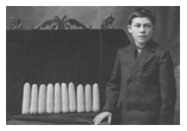
Early corn growing contests created healthy competition and ways to teach evaluation of quantity and quality.