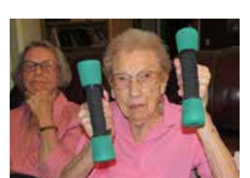
StrongWomen is an effective and popular strength training program for middle-aged and older adults.

In the 1980s, leaders in the community development and health education professions were seeking new methods of creating healthy, stabilized, and economically-sound communities (Minkler, 1989). A quasi-longitudinal case study of Conrad was conducted in 1988 by Counter (1991) and her research team from the MSU Kellogg Center for Adult Learning Research. The purpose of this research study was to determine if Montana Study methods were viable for adult education and community development. Historical analysis of primary documents and oral histories with people who had participated in Conrad's study and action groups were conducted, with all of the interviewees in their eighties. The MSU researchers discovered that the Conrad action group had remained proactive for over 40 years. Outcomes of this group included a nursing home, retirement apartment complex, senior center, swimming pool, irrigation system, and high school. The action group process learned from the Montana Study allowed the group to learn new skills in discussing issues, conflict management, and research and to share their