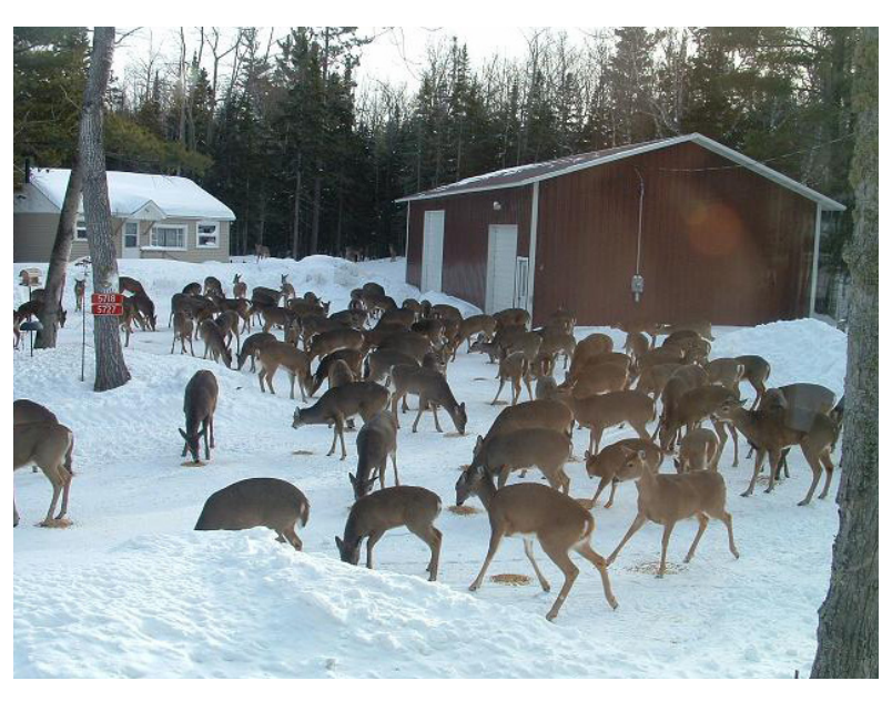
Figure 1. Illustration of some of the unintended consequences (e.g., abnormal concentration of deer and/or dependency on an artificial food source) that can occur from providing deer with a supplemental food source.

In addition, deer can become fixated on a food source. Deer will stay near a sure food source, even an inadequate one, rather than seek more sufficient food in other areas. Once