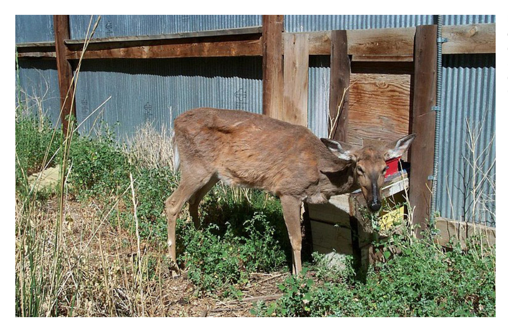
Figure 4. Deer shows classic clinical signs of chronic wasting disease: emaciation, wide stance, lowered head, and droopy ears.

to assure themselves a share of the food. The ones that need the food most (i.e., young, old, sick, in poorest health), are kept away by larger or stronger deer.