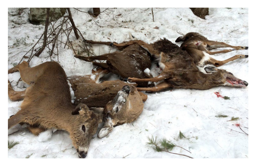
Figure 2. Deer discovered near South Hampton, N.H. in 2015 that were suspected to have died from enterotoxemia; a condition caused by a rapid change in diet often associated with winter feeding.

food is discovered, deer concentrate around a feeder rather than scattering through the available winter range. Often, they remain in an artificial feeding area getting only half the food they need rather than fighting the snow to use natural browse. They quickly deplete any close-by forage and can stay in a feeder area until they starve to death. This is why spring searches often reveal concentrations of dead deer within the immediate vicinity of feed areas.