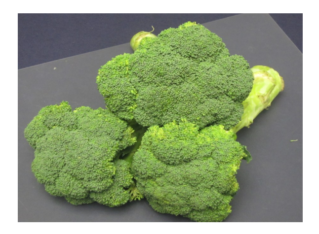
Wash hands. Rinse broccoli to remove sand and dirt.