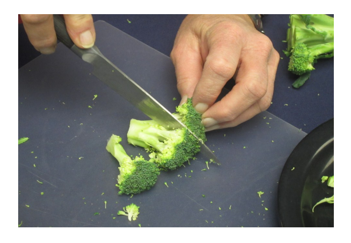
Chop broccoli into 1/4- to 1/2-inch sections to add to salads and pastas or for eating raw.