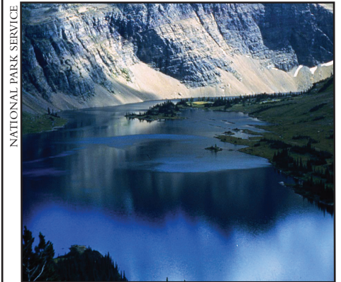
NATIONAL PARK SERVICE Hidden Lake at Glacier National Park.

(cont from High Pesticide Concentrations in Glacier National Park on pg 1)