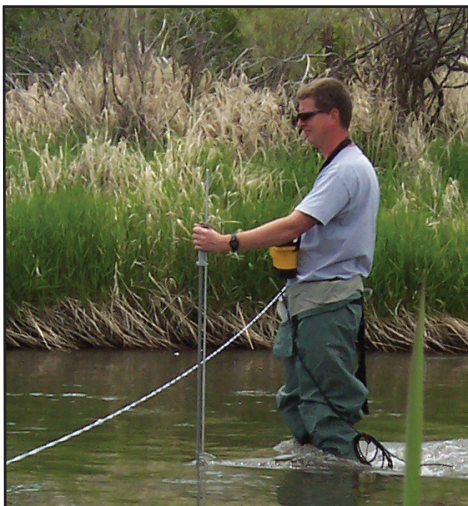
MONTANA DEPARTMENT OF AGRICULTURE

The presence of nitrate may be due to fertilizer, animal waste (including septic effluent), or it may be naturally occurring. Nitrate was detected in 76 percent of the groundwater samples. None of the nitrate concentrations exceeded the human health drinking water standard of 10 parts per million and only 2 of the samples from a single site exceeded 50 percent of the standard. Nitrate was not detected in any of the surface water samples.