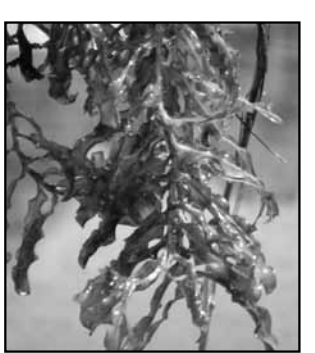
CURLY PONDWEED

a submersed aquatic plant. It is native to Eurasia, Africa. and Australia and was introduced to U.S. waters in the mid-1880s by hobbyists who used it