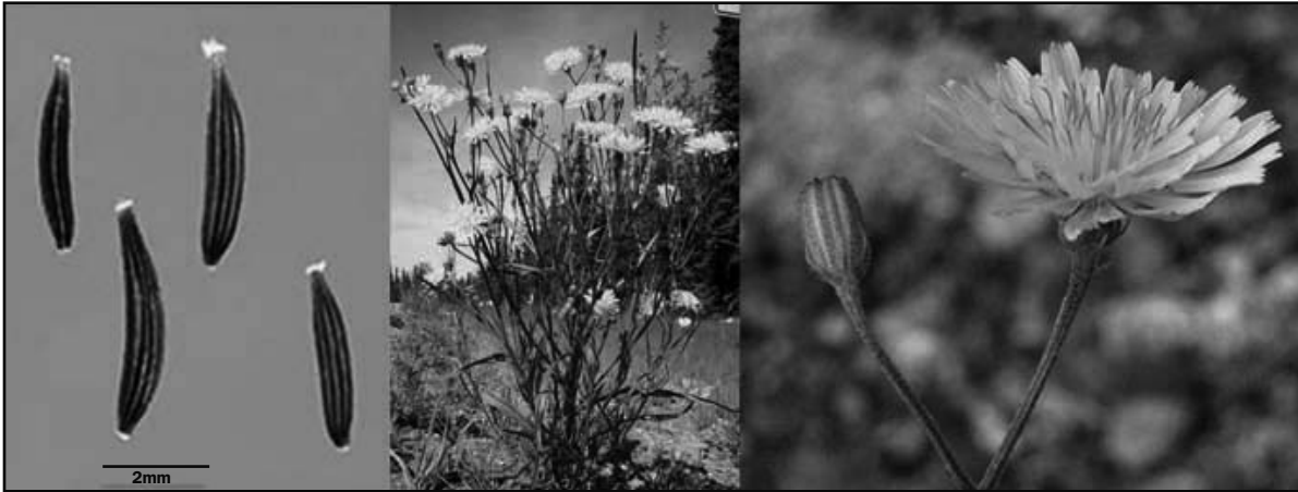
FROM LEFT TO RIGHT, NARROWLEAF HAWKSBEARD SEED, ADULT PLANT, AND INFLORESCENCE.