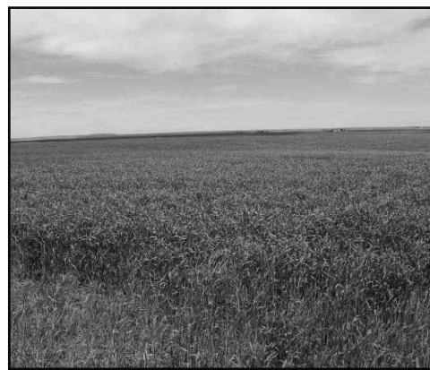
FIELD OF GENOU HARD RED WINTER WHEAT INFECTED BY STRIPE RUST.

The other major disease we had to deal with this last year was stripe rust. There are a number of reasons we had such a big problem. We had widespread infection of winter wheat in the fall of 2010. Among these infections was a new strain called PST v-17, which had hopped the Rockies and was present in Toole and Choteau counties (this information is why it is important to submit samples!).