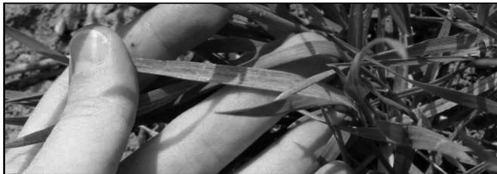
SYMPTOMS OF WHEAT STREAK MOSAIC VIRUS ON WHEAT

This strain was highly virulent on a widely planted variety, Genou. We also had a warm, extended fall and snowcover on infected plants – both these factors allowed the pathogen to replicate and spread in the fall and overwinter on infected plants. In the spring we had very favorable temperatures, significant moisture and flooding. This resulted in ideal conditions for disease development and high humidity throughout most of the growing season. Yellowstone, a variety that is resistant to the new strain, showed symptoms early in the season due to the low temperatures – this variety, and others, have what we call 'High Temperature Adult Plant Resistance.' The resistance to stripe rust doesn't kick in until after stem elongation (Feekes 4-9 or Zadocks 30-39) and average night temperatures remain above 50°F and day temperatures are between 77 and 86°F. Even after the rains stopped in mid-June and the temperatures during the day turned very warm, night temperatures were still favorable (50-70°F) and the humidity was high.