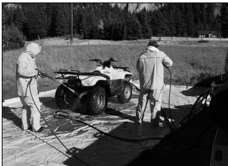
LISA REW 2010

You can read more about this research in two new MSU Extension publications “Weed Seed Dispersal by Vehicles” (MT201105AG) and “Washing Vehicles to Prevent Weed Seed Dispersal” (MT201106AG). The publications are free and can be downloaded or ordered through MSU Extension publications online at http://www.msuxextension.org/store/ ; by calling (406)994-3272; or by sending an email to orderpubs@montana.edu .