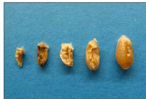
FIGURE 2. Damage to wheat kernels by orange wheat blossom midge larvae.

Meet Your Specialist: Jessica Rupp .....7