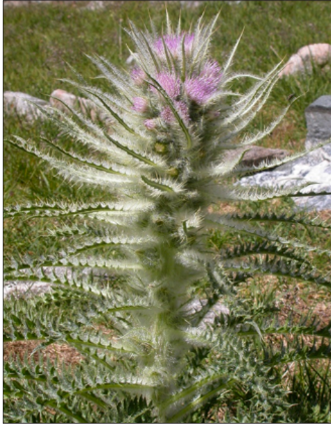
FIGURE 4. Meadow or elk thistle ( Cirsium scariosum).