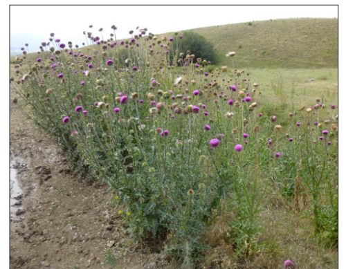
FIGURE 5. Musk thistle ( Carduus nutans ) infestation along a road.

These tips are adapted from Guide to Exotic Thistles of Montana and How to Differentiate from Native Thistles , a publication from Montana State University Extension that is designed to help identify exotic, invasive thistles and verify whether a thistle is native or exotic, thus helping to determine if control strategies are necessary (Parkinson and Mangold 2015, publication EB0221). The publication includes a tutorial of how to use a simplified dichotomous key and a brief description and photos of the important anatomical features and terms that are needed to successfully identify the thistle. Photos