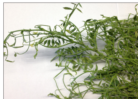
FIGURE 12. Chickpea showing symptoms of suspected herbicide carryover.