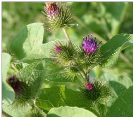
FIGURE 8. Common burdock flowers are pink to purple and enclosed in a prickly bur.