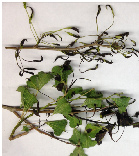
FIGURE 10. Aspen showing symptoms of suspected herbicide drift.

Herbicide labels contain vital information for reducing the risk of non-target herbicide injury. Restrictions and recommendations found on a product label may include those about weather conditions, re-crop intervals, and pre-harvest intervals, and understanding these will help avoid the types of non-target injury described in this article. Diagnoses at the SDL are based on visual assessment of plant symptoms only and are not proof that an herbicide was involved in a given case. If you would like to have plant tissue or soil tested for herbicide residue, contact the Analytical Lab on the Montana State University campus at 406-994-3383 ( http://agr.mt.gov/Analytical-Lab ). For more information see the MSU non-target plant toxicity home page at http://www.pesticides.montana.edu/reference/planttoxicity.html , or if pursuing reimbursement for pesticide-related non-target damage, contact a Montana Department of Agriculture Enforcement Officer at http://agr.mt.gov/About-the-Department/Office-Locations .