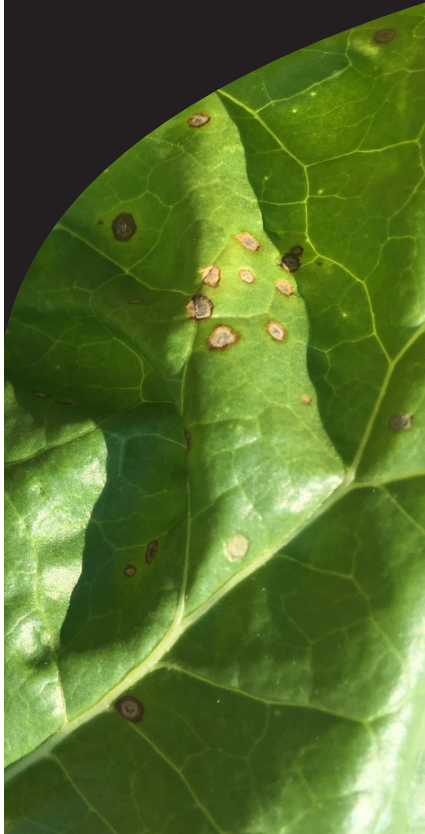
FIGURE 1. Early infection of sugarbeet with CLS. Lesions are small and round with a dark brown border.