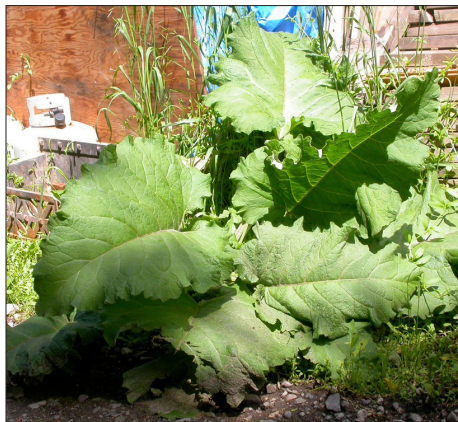
FIGURE 7. Large, heart-shaped leaves of common burdock.