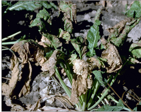
FIGURE 3. Older leaves die due to Cercospora infection, thereby vastly reducing the plant's ability to store energy in the form of sugars in the root.

from NDSU indicates that this fungicide combination works best when used as the first foliar fungicide application. This application is to prevent the disease and apply prior to identifying CLS in the crop. DIVs are reported by the Sugar Co-op agriculturalist in the region and should be used as the indicator of disease risk. Agricultural staff will provide advice on timing of the first spray application when environmental conditions are right for the disease. Never apply the same fungicide(s) or fungicide classes consecutively. Use at least \frac{3}{4} rate of all fungicides applied in a tank mix.