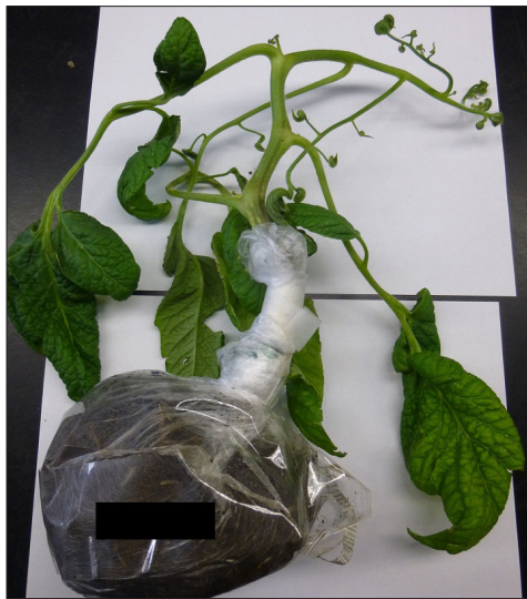
FIGURE 11. Tomato showing symptoms consistent with herbicide carryover.