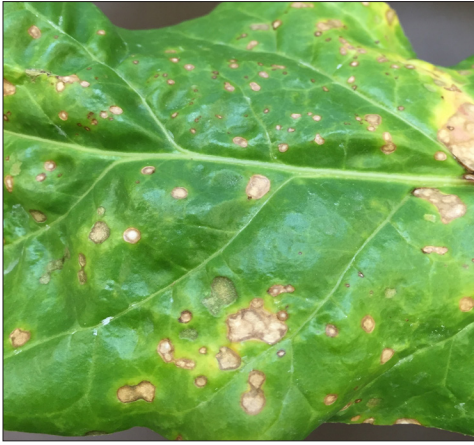
FIGURE 2. Cercospora lesions coalesce if the disease is allowed to progress.