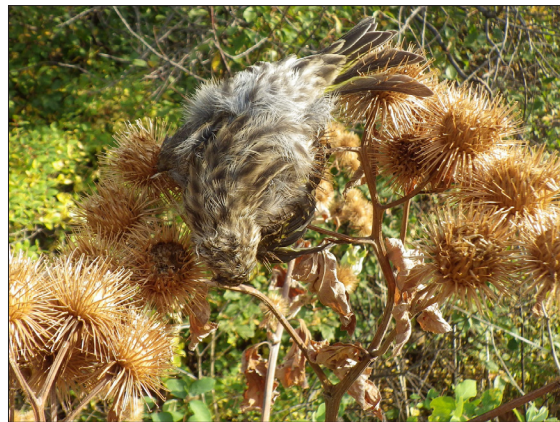
FIGURE 9. Bird entrapped on common burdock burs.

in areas of disturbance, it usually does not grow in areas that are severely disturbed on an annual basis, e.g., cultivated fields. One plant can produce 15,000 seeds. Flower bracts are tipped with hooked spines, which can easily attach to clothing or animal fur, thus dispersing the seed far distances. It has been suggested that seed viability for common burdock is only 1-3 years.