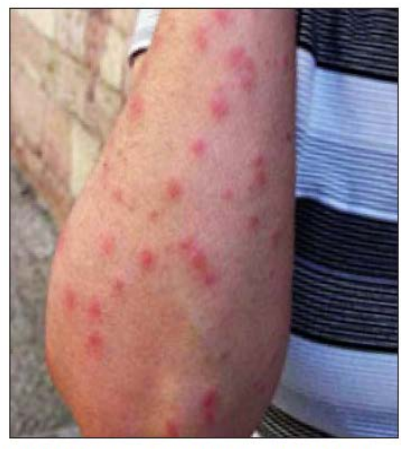
FIGURE 2. Bite welts. (<u>urbanentomology.tamu.edu/bedbugs.cfm)</u>

Bed Bugs are a growing problem in many schools, hotels, and residences across the nation. A 2012 survey of pest management professionals conducted by the National Pest Management Association (NPMA) found that bed bug reports are more common in public places than in previous years. Bed Bugs seem to prefer high traffic areas, including hotels and schools. Before taking your vacation this summer see the pro-active Bed Bug advice for travelers at 'prevention tips for travelers', or the MSU Extension 'MontGuide' for comprehensive information regarding Bed Bugs.