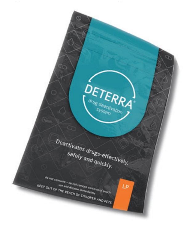
A Deterra drug deactivation pouch.

As soon as you no longer need medication, dispose of it right away. Do not keep opioids "just in case." The best place for unused medications is in a prescription drug drop-box. To find a nearby drop-box in Montana, visit <u>https://dphhs.</u> mt.gov/amdd/substanceabuse/dropboxlocations.