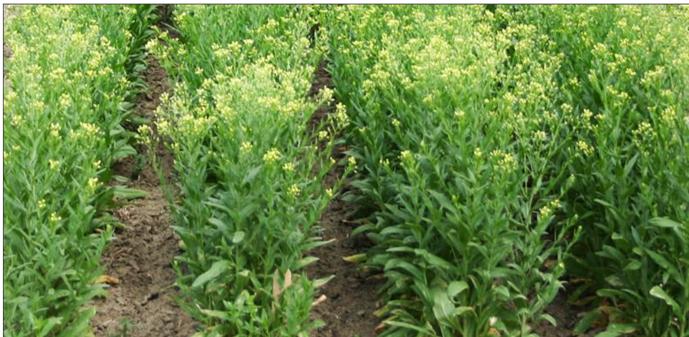
FIGURE 2. Camelina plants bloom with small, four petal, yellow flowers.

Concurrently camelina meal is being fed to 2 and 3 year-old beef cows to evaluate the potential to use the meal as a protein and energy source for breeding beef cattle. The objective of the trial is to determine if the beneficial effects seen in humans from consuming elevated levels of omega-3 also occur in beef cattle. If camelina meal can effectively be utilized for production of omega-3 enriched beef, beef will constitute the largest single market for camelina meal in Montana. For more information contact Darrin Boss, Northern Agricultural Research Center, Havre, Mont.