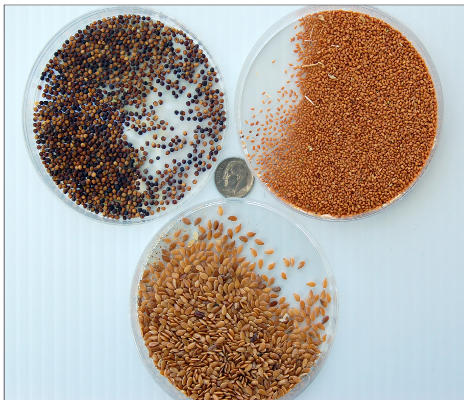
FIGURE 4. Camelina seed (upper right) is very small as compared to canola (upper left) and flax seed (bottom).

Seed characteristics of camelina are different than those of other oilseed crops. Camelina is a very small seed (see Figure 4), but it does not roll like canola or flow like flax. Filling cracks by taping or caulking truck beds and storage bins should be done prior to harvest to prevent seed loss. To date, there have been no reported observations of insect damage to seed occurring during bin storage. Currently no bin insecticide treatments are registered for use on camelina seed, so none should be used.