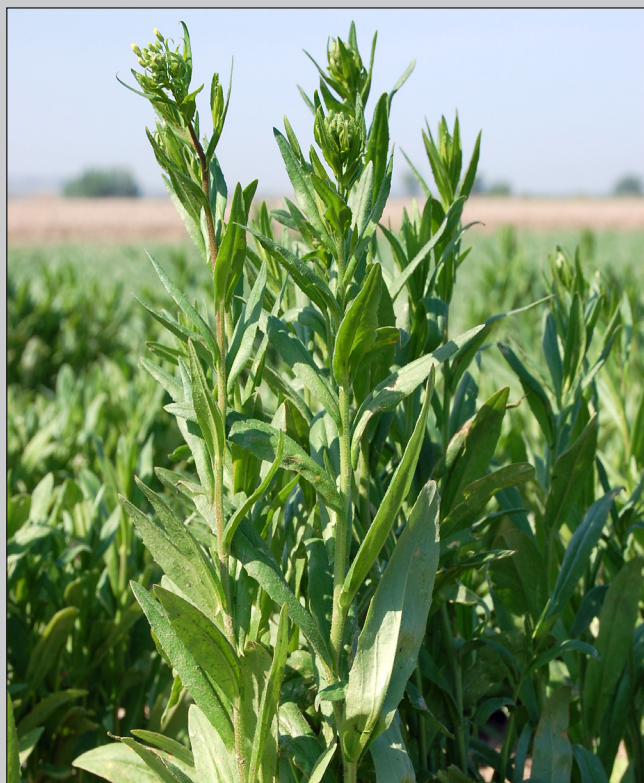
FIGURE 1C. Seed pods of camelina on multiple branches.