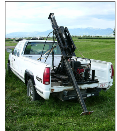
FIGURE 2. Soil sampling vehicle-mounted hydraulic probe.

Ideally, soil sampling occurs yearly in the spring to best estimate growing season nutrient availability; however, due to time constraints and soil conditions, it may be more practical to sample soil in the fall or winter. Sampling in the fall does not always capture the true amount of N that will be available at spring seeding because some N is released from soil organic matter (SOM) during the winter months in a process called "mineralization," or conversely, N in a very wet year, can be leached. Fall nitrate-N levels will be similar to spring nitrate-N levels if the fall and winter are cold and dry, because these conditions essentially stop N mineralization and leaching. Coarse or shallow soils (less than two feet) tend to have larger changes in nitrate levels over winter and should be sampled in the spring (Jones et al., 2011). Most importantly, submitted samples should be mixed