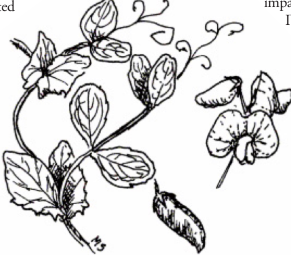
FIGURE 1. Dry pea (Pisum sativum) plant characteristics

chemical practices to reduce the spread and impact of weeds. The main goals of an