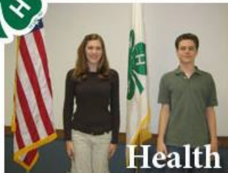
Health for Better Living

...for my Club, my Community, my Country and my World.