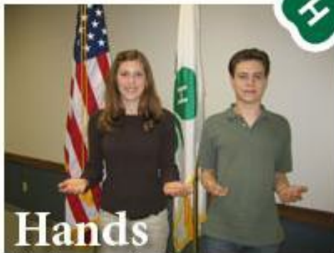
Hands for Larger Service