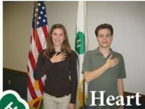
Heart for Greater Loyalty