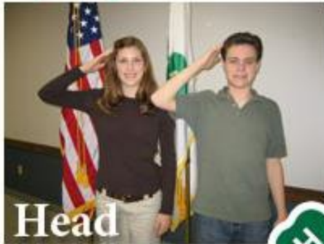
Head for Clearer Thinking