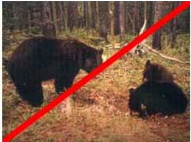
Black bear with cubs