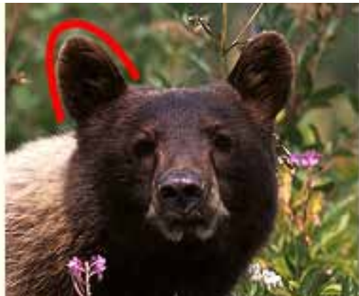
Black bear Large and pointed ears