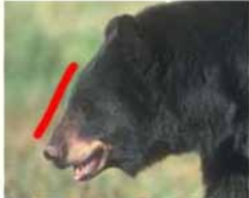
Black bear Straight facial profile