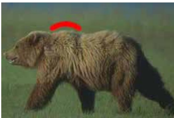
Grizzly bear - shoulder hump

muscles for digging and turning over rocks. These muscles appear as a prominent shoulder hump between the front shoulders, which is visible in profile. Black bears have no shoulder hump. A black bear's highest point, when it's on all fours, is the middle of the back or the rear, depending on how the bear is standing.