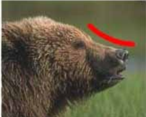
Grizzly bear Dish-shaped facial profile

from forehead to nose tip. The dished-face profile of the grizzly makes the face appear broader (when seen full front) than that of the black bear; the face and forehead of the black bear appears more round.