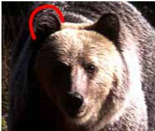
Grizzly bear Small and rounded ears

Grizzly bears have smaller, more rounded ears, whereas the ears of a black bear appear larger, longer, more erect, and pointed.