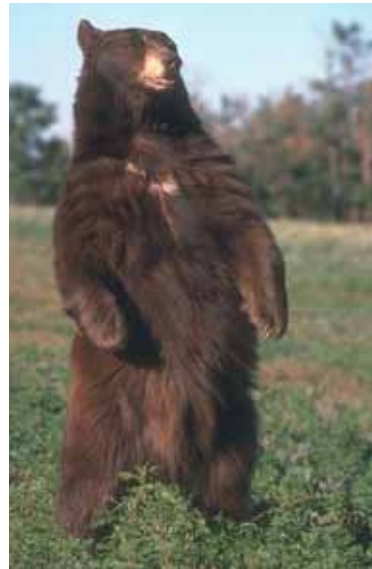
Large black bear

Just like color, body size is also not a reliable indicator for identifying bears. Most people tend to overestimate the weight and size of bears. A typical adult female grizzly weighs 200-350 pounds and adult males weigh 300-650 pounds. An adult black bear, which can easily weigh 200-300 pounds, may not only weigh the same as a female grizzly but also be about the same height (3-3½ feet at the shoulder). Then too, an adult male black bear will be much heavier and taller than a young grizzly. And just in case it isn't difficult enough yet, try to imagine yourself distinguishing a juvenile dark-haired grizzly from an adult cinnamon-colored black bear in the dim light of an early morning or the long dusky shadows of an early fall evening. Even under the best of conditions you'll find it's nearly impossible to judge the size and weight of a bear in the wild.