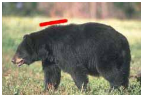
Black bear - no shoulder hump