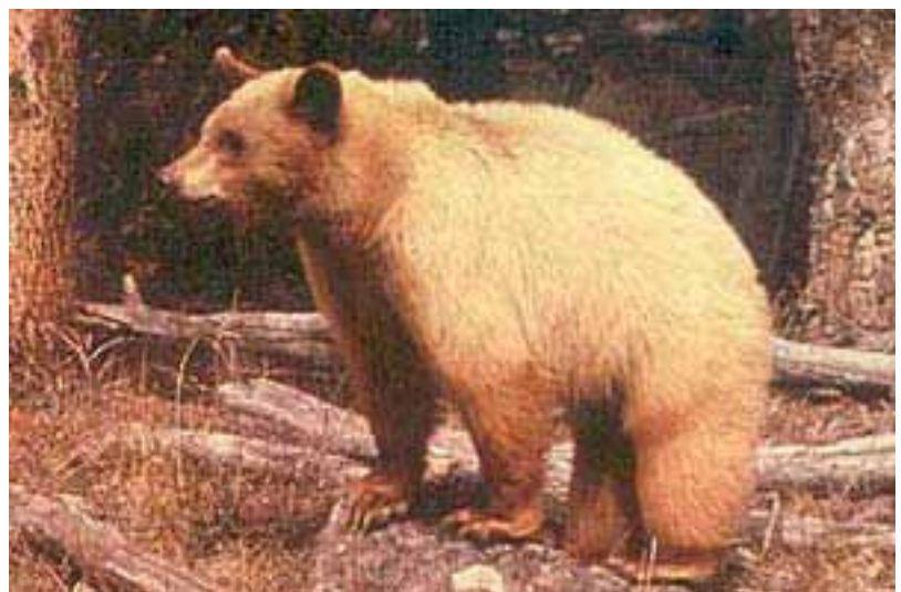
A “non-black” black bear