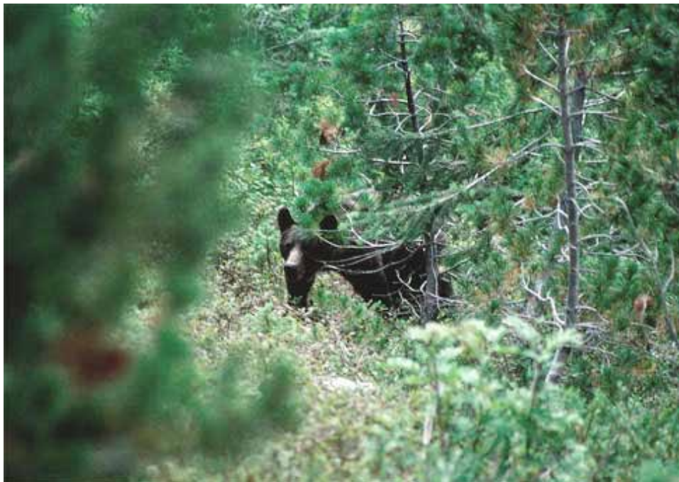
When in doubt, don't shoot!