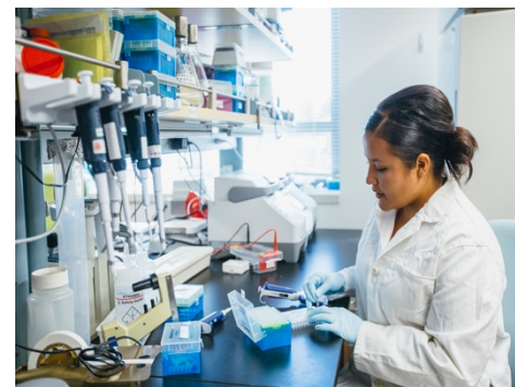
Molecular analysis of mammalian gut microbiome

Department: Microbiology & Immunology Theme: Microbiology of Low Oxygen Ecosystems (MLOxE) Program Dates: May 24 - July 30, 2021 Deadline: February 28, 2021 Website: http://www.montana.edu/mbi/reu/