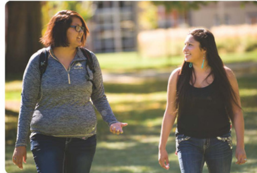
Photos from top to bottom: American Indian Hall; Engineering students study together in the Empower Student Center; President Waded Cruzado joins students for a round dance during Indigenous People's Day; Students on the MSU campus