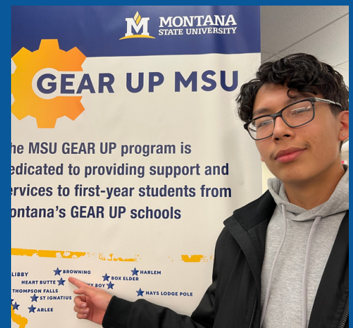
Seth Still Smoking: Browning, MT