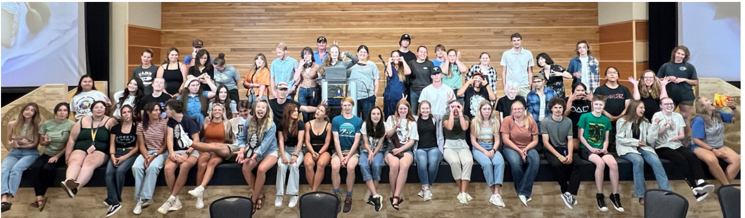
GEAR UP and TRIO students together at the Fall 2022 Kick Off event.

To learn more and to find the application for the TRIO Scholars program, visit www.montana.edu/trioss . For any questions, feel free to reach out to GEAR UP or TRIO staff or visit our offices!