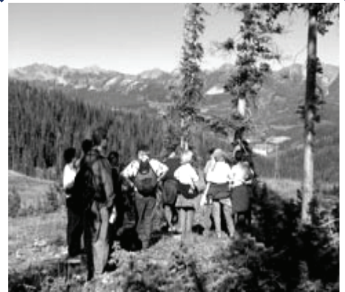
Hiking at Big Sky (Spaces of Struggle Conference)