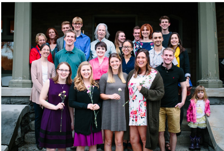
Students and Faculty mingled at the Department's annual award ceremony last April honoring both undergraduate and graduate students.