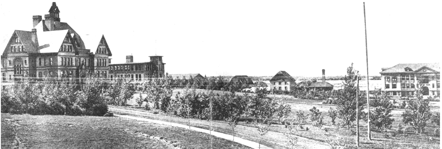
Montana State University Campus Panorama 1910

Please feel free to drop by Wilson Hall 2-155 to see what new and exciting things the History & Philosophy Department is doing. If you have questions, give us a call at 406-994-4395 or email us at history@montana.edu .