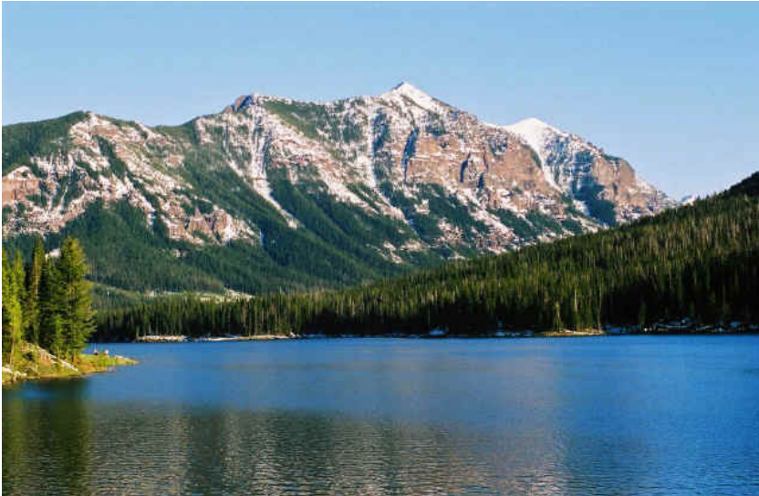
Hyalite Reservoir - 10 miles from campus