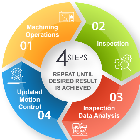
Figure 3. The process of continuously measuring outcomes of a machining operation with non-contact CMM technology to continuously adjust for the difference between the actual and desired geometric machining results.

By continuously measuring the outcomes of the machining operations with the non-contact CMM technology, MSU can continuously adjust for the difference between the actual and desired geometric machining results (Figure 3). This allows an increase in the tolerance capabilities of a less stiff machine beyond its baseline. A smaller machining center would result in smaller footprint needs and smaller/cheaper glove box enclosures. Also, having been inspected in situ, there is a significant potential for reducing rework. If a piece can be determined to be terminally out of specification, the machining process can be terminated, reducing production time and cost.