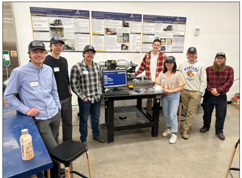
Figure 4. MSU Capstone students responsible for the design and build of the Future Advanced Machining Platform Testbed (FAMPT).

MSU has classified research capabilities, cleared professional staff, and a strong engineering student population. In addition to work product, MSU continues to provide LANL with the opportunity to hire four cleared graduates with relevant work experience from our student research teams.