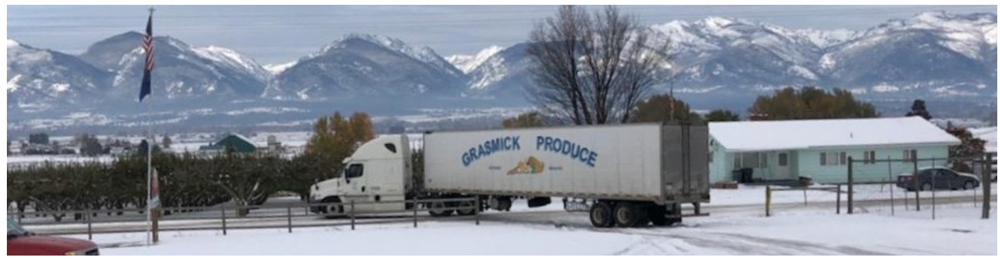
Grasmick Produce leaving Swanson's Mountain View Orchards, courtesy of Pam Fruh, OPI.