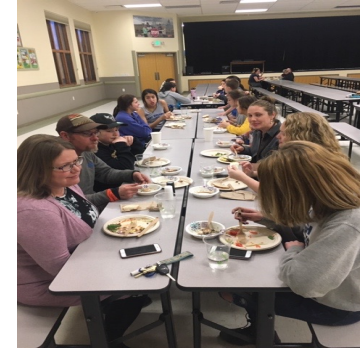
Local Sourced Dinner: 1 Book/1 Sch.