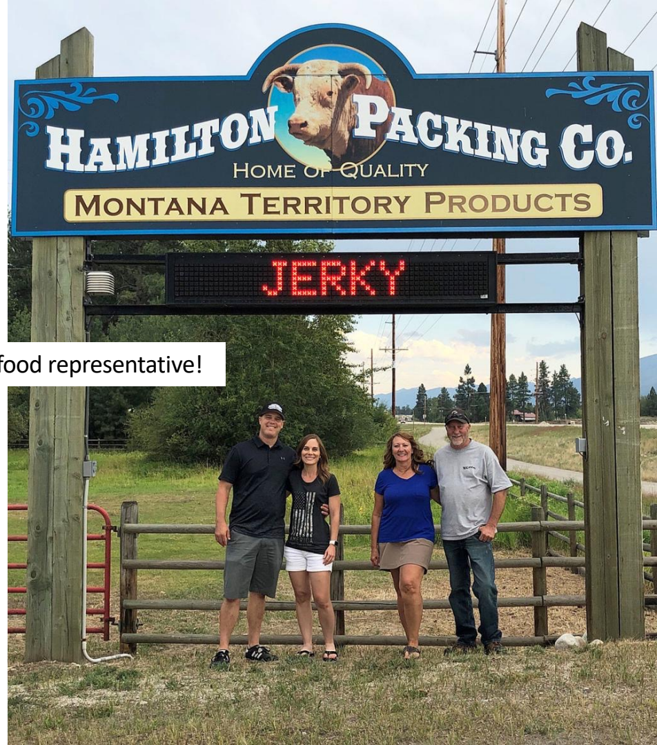
Two F2S projects and food representative!