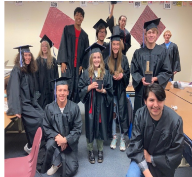
Graduates Grow Plants in English Classroom