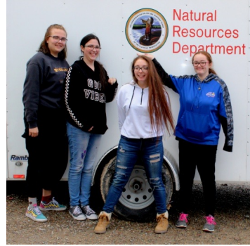
Recycling Prog. w/SKC & Tribal Support