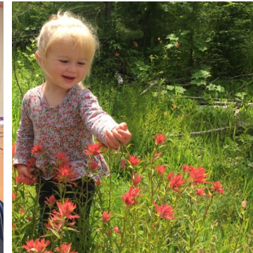
Granddaughter enters sch. next year: To whom the Earth belongs.