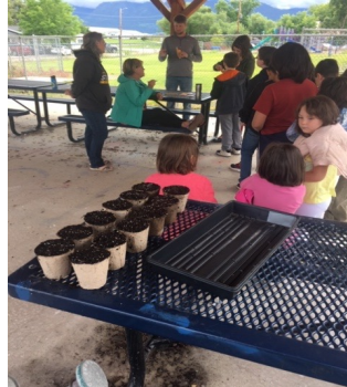
Planting w/Elementary Sum Prog.