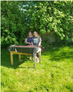
ADA Comm. Planting Boxes