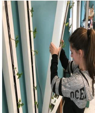
MS Hydroponic Herb Wall