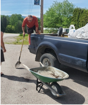
Install Comm. Planting Boxes