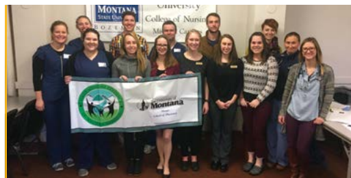
Group of students who were involved with the simulation activity in March 2017.

The first interprofessional simulation laboratory activity on the Missoula campus brought together MSU nursing and UM pharmacy students with medical residents, to work together on two clinical cases in the simulation laboratory. The focus of this activity was on inter-professional communication while providing care in a realistic patient simulation.