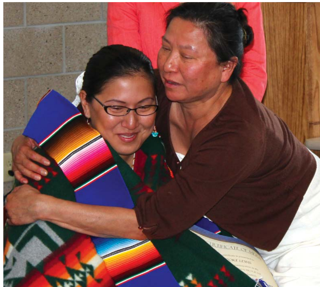
CO-OP Graduation Honoring Ceremony.