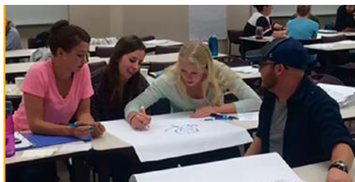
Students doing an in class activity with the elective course.

One student who took the elective course and participated in the simulation activity shared this comment, “I was a student who took the IPE elective last semester and one thing I found the class lacking in was hands-on participation and practice as IPE teams. This IPE [simulation] experience was exactly what was missing. It was wonderful to talk and learn about the various professions we will all eventually be working with, but to actually work together with each other in taking care of a patient was invaluable. I know it is a long process, but I hope this type of experience can be incorporated into each program’s curriculum. There are some things that cannot be taught, you simply have to experience them yourselves.” Future plans include: a) having IPE simulations each semester which include other disciplines; b) conducting larger simulations in classrooms w/increased viewing potential including live streaming; and c) allowing more students to participate by having simulation activities take place over the course of a full day or several days.