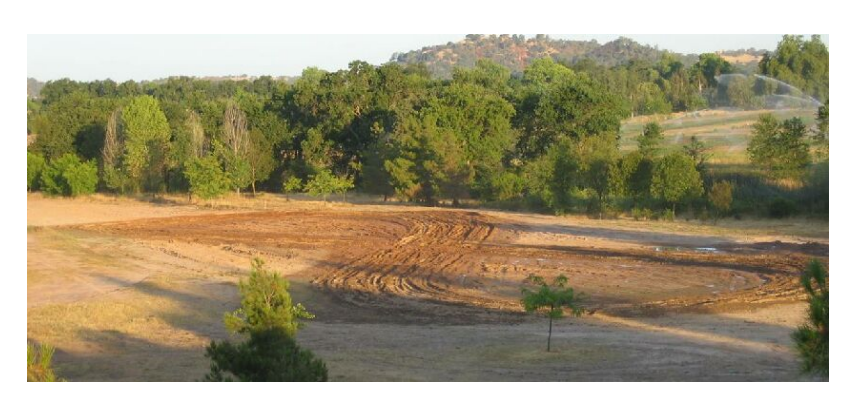
Figure 1. Test Driving area at Cal Fire Academy, Ione, CA.

Wheeled vehicles were driven 15 m through a fabricated mud bog (Figure 2) and then 2.75 times around the figure-8 course (Figure 1) before returning them to the washing area on the helipad. Total distance driven on the figure-8 soil was ~650 m. This varied slightly, because successive drivers could not travel the exact path of the previous vehicles, but the exact total soil adhering was not a measured variable in any case. The road distance, on a gravel road, from the helipad to the test course was ~382 m. The paved helipad segment of the test course measured 135 m. The total distance driven for each test, on all surfaces, including transitions, was ~1720 m.