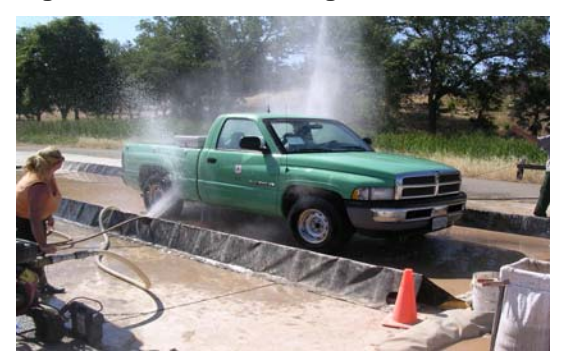
Figure 4. Four-by-four pickup on wash pad.