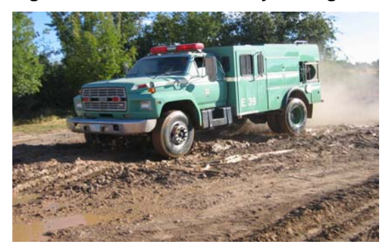
Figure 3. Class 3 fire engine on course.