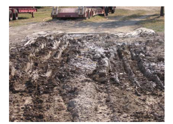
Figure 2. Constructed muddy driving area.